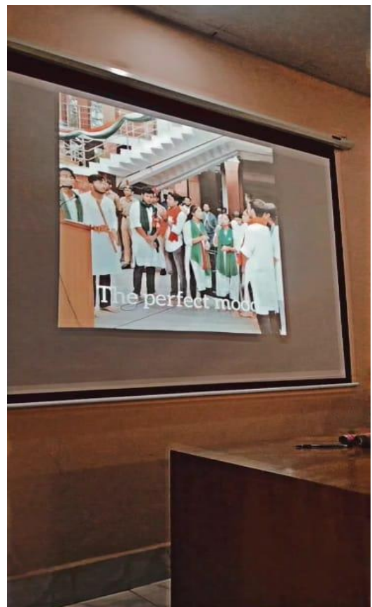
PRESENTATION OF PAST PERFORMANCES